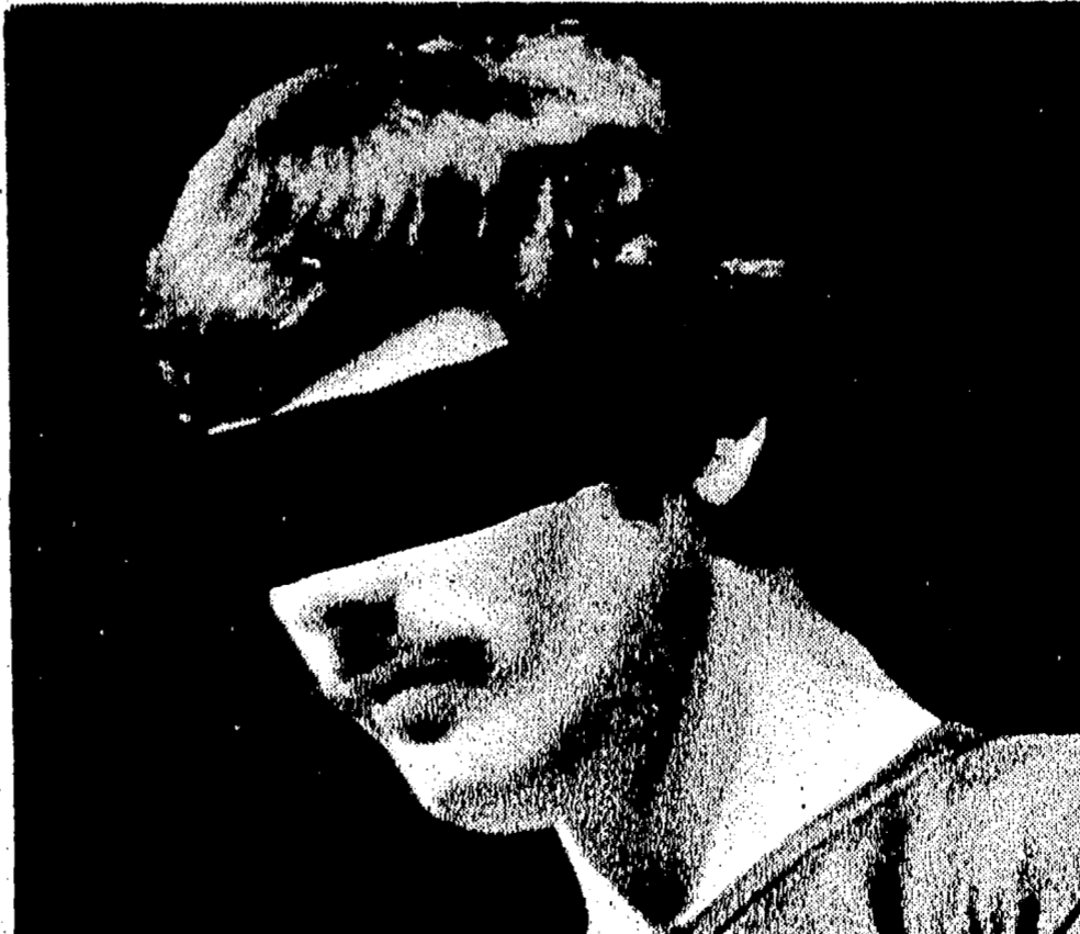
One of the yet unknown high government officials responsible for the Pig Flu Plot. Unfortunately, their names are being withheld until notification of next of kin.

If you are worried about contracting the Pig flu it is suggested that you should immediately be inoculated. You may want to wait until after you enjoy the early symptoms for a while. Do watch out!