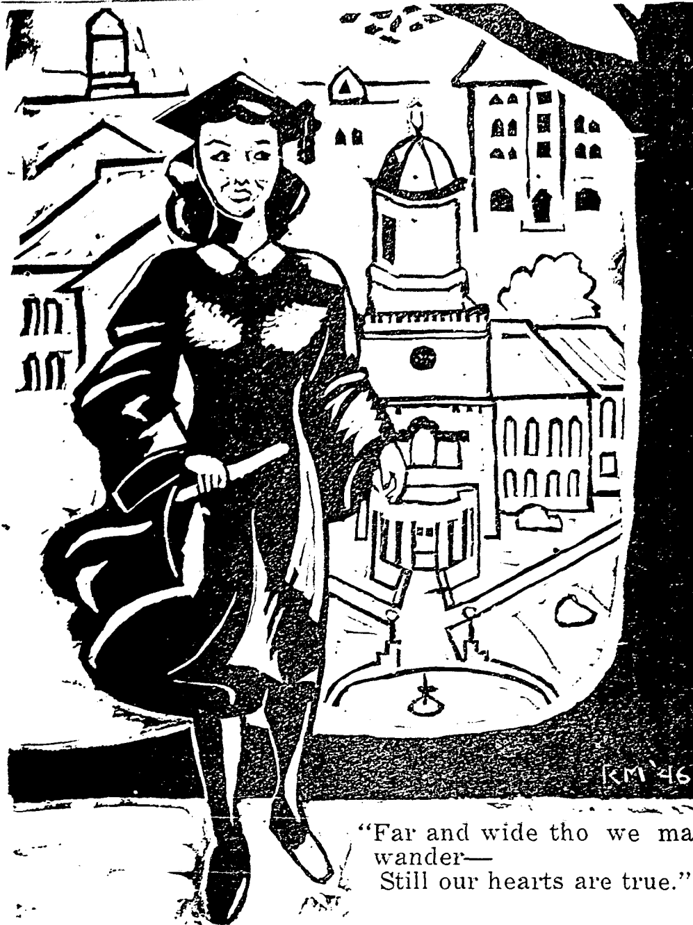
"Far and wide tho we may wander— Still our hearts are true."

She was only a cannibal's daughter, but she liked all her boy friends stewed.