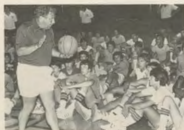
Villanova Coach Rollie Massimino makes a point.