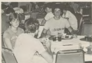
In the Scranton Commons the campers get all the "seconds" they can eat.

Basketball Office Bloomsburg University Bloomsburg, PA 17815 or phone (717) 389-4358 or 4555