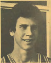
No. 30 & 31

Year 1974-75, G 25, FG-FGA 94-231, Pct. 40.7, FT-FTA 39-68, Pct. 57.4, Reb. 167, Avg. 6.7, Assists 31, TP 227, Avg. 9.1.