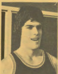
No. 44 & 45

Year 1974-75, G 10, FG-FGA 36-83, Pct. 43.4, FT-FTA 8-9, Pct. 88.9, Reb. 69, Pct. 6.9, Assists 7, TP 80, Avg. 8.0.