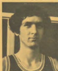
No. 34 & 35