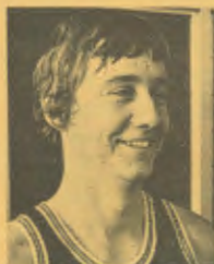
No. 14 & 15