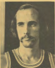
No. 10 & 11