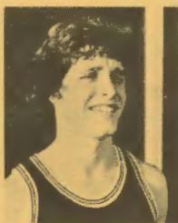
No. 12 & 13

Year 1974-75, G 25, FG-FGA 148-324, Pct. 45.7, FT-FTA 30-41, Pct. 73.2, Reb. 113, Avg. 4.5, Assists 53, TP 326, Avg. 13.0.