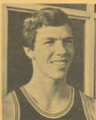
No. 22 & 23