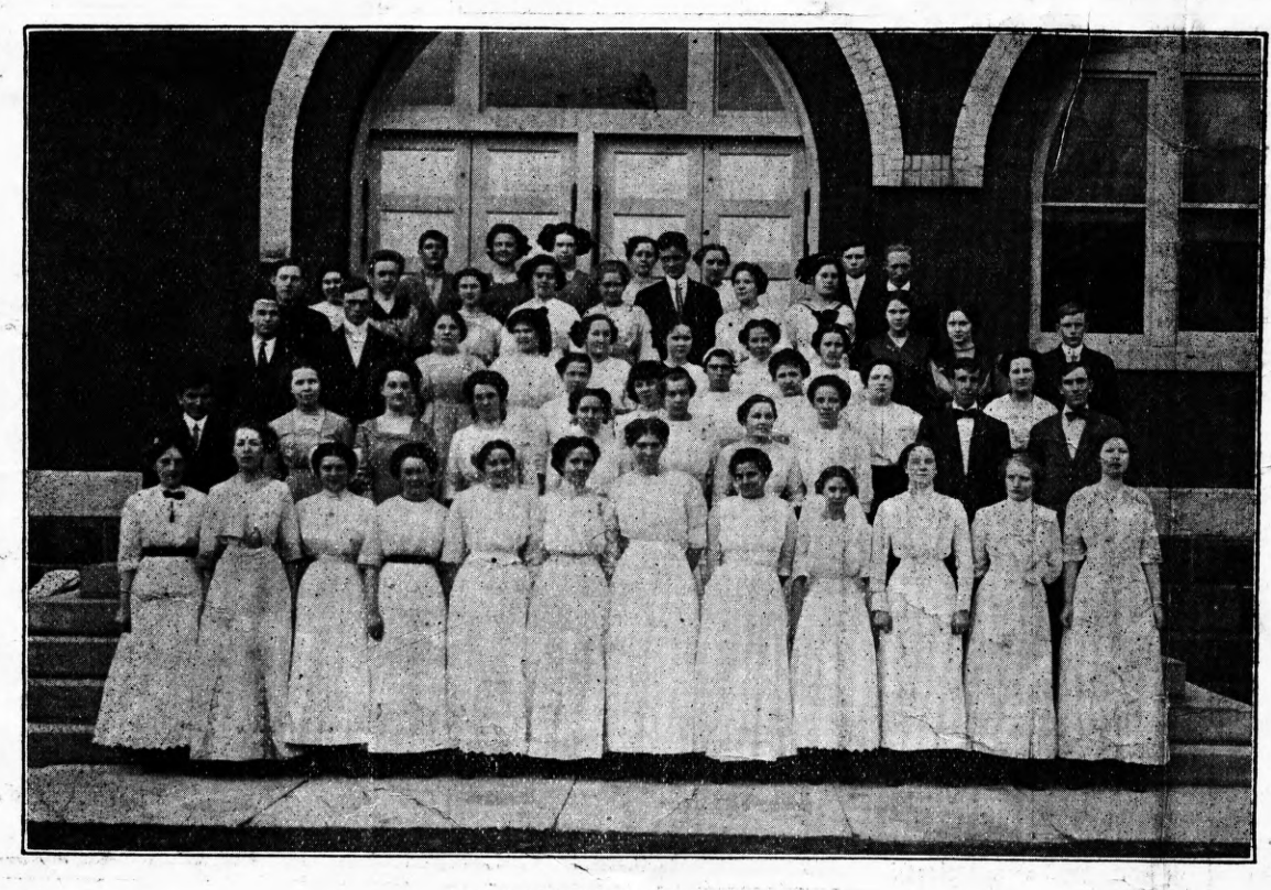
STUDENTS IN TEACHERS' COURSE