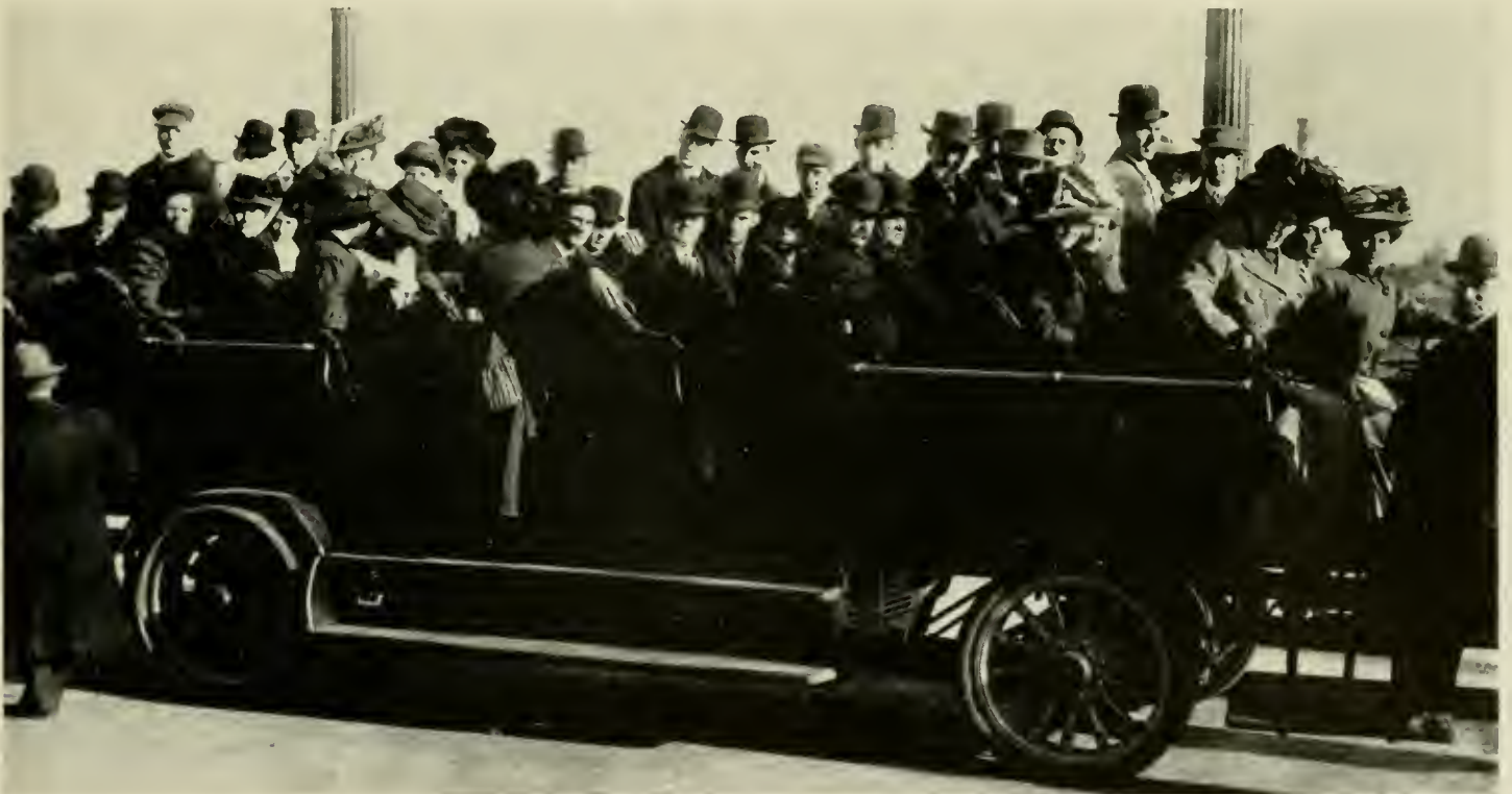
The Washington Excursion — 1910