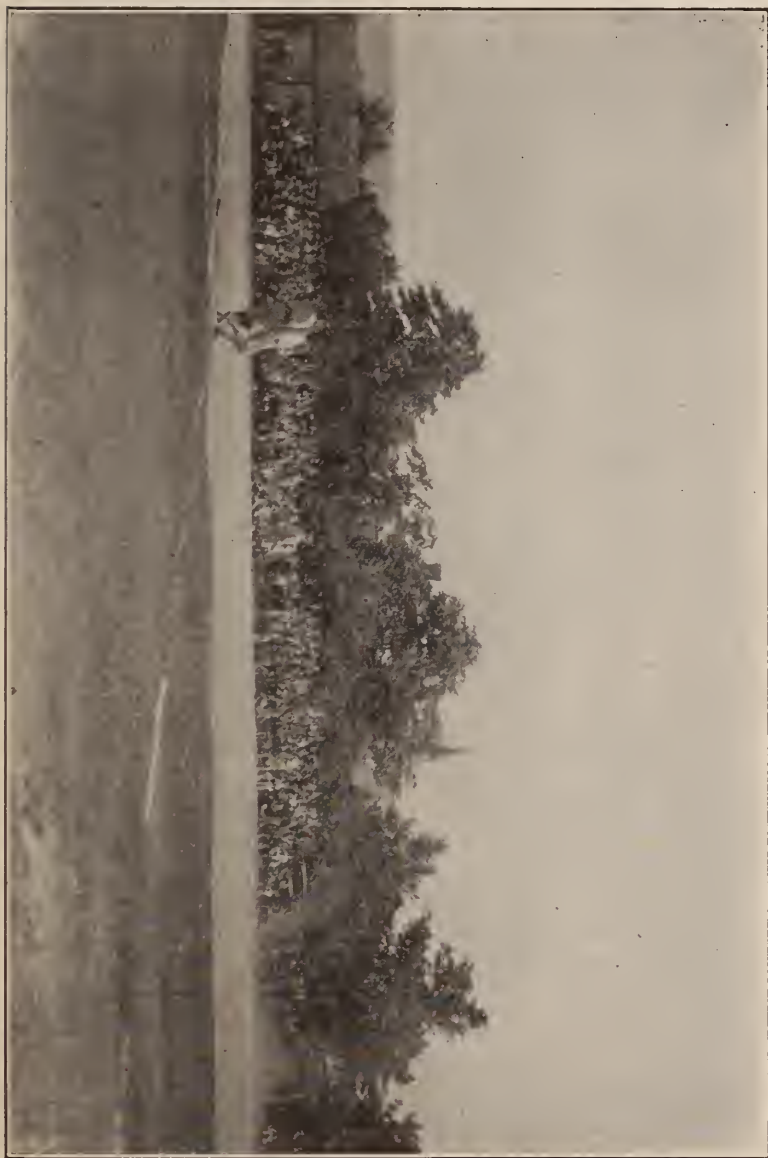
VIEW OF ATHLETIC FIELD