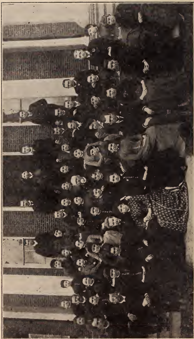
CLASS OF 1988