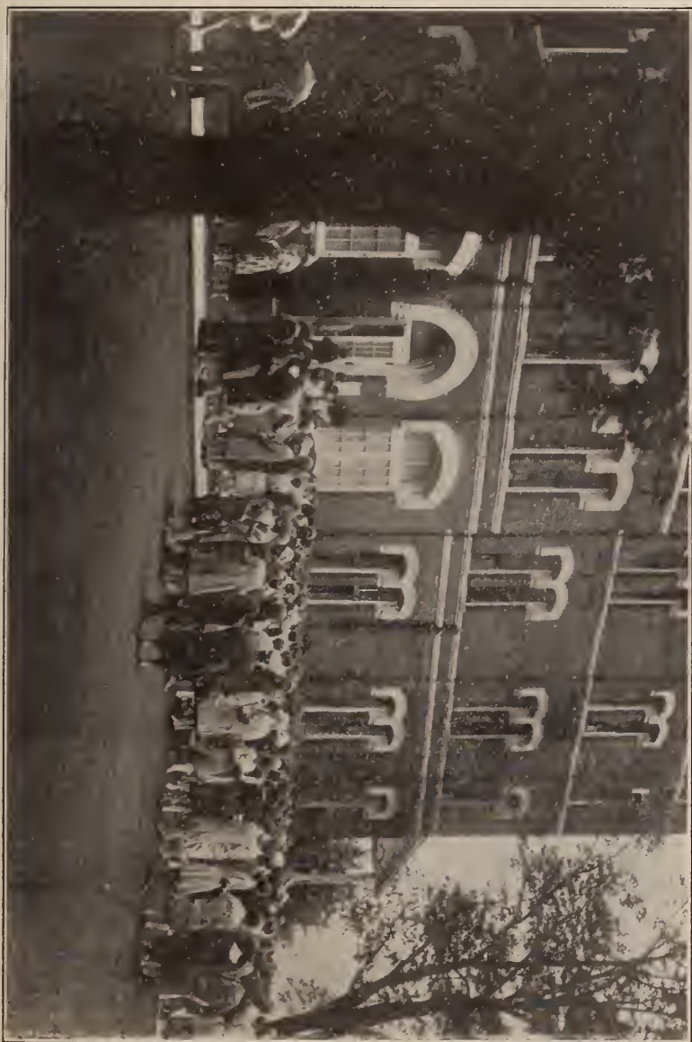
ASSEMBLING FOR THE ALUMNI BANQUET