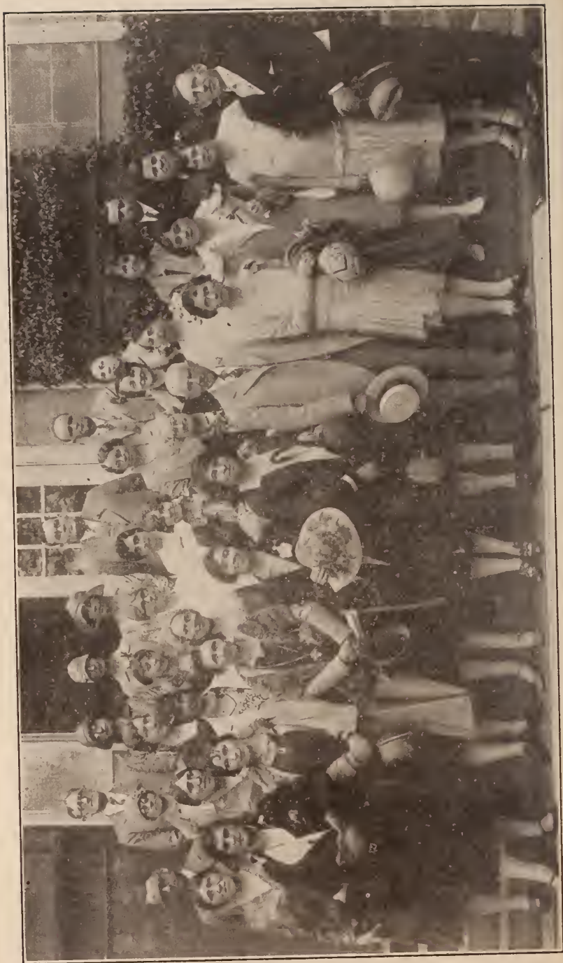
CLASS OF 1908