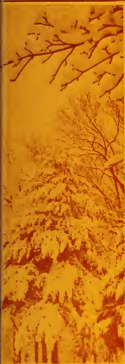
"WINTER ON THE CAMPUS"

Home-Coming Day Reviewed ● Continuation of Alumni Directory, 1912 to 1918 ● Regional Group Activities