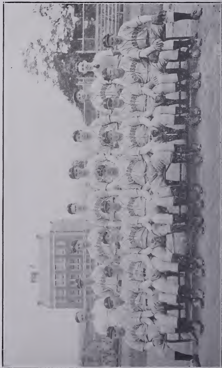
THE 1935 BASEBALL SQUAD