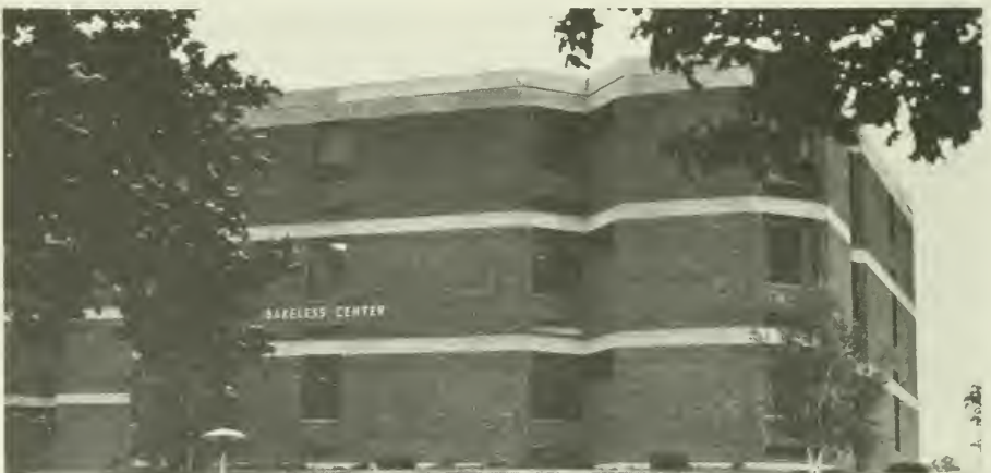
Bakeless Center for the Humanities.