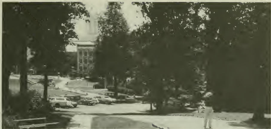
A stroll through the old Grove.