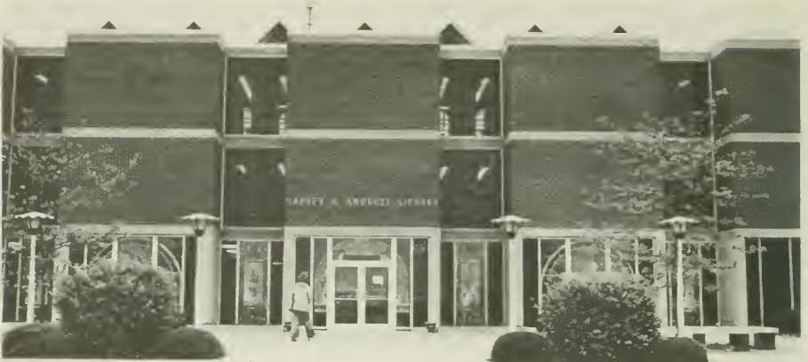
The west side of the Harvey A. Andruss Library, with the Tiffany Windows transferred from Old Waller Hall.

three trustees was appointed to confer with the sheriff, asking a postponement until October 15. The sheriff consented, and some settlement was made as no mention of the sheriff's sale was made again.