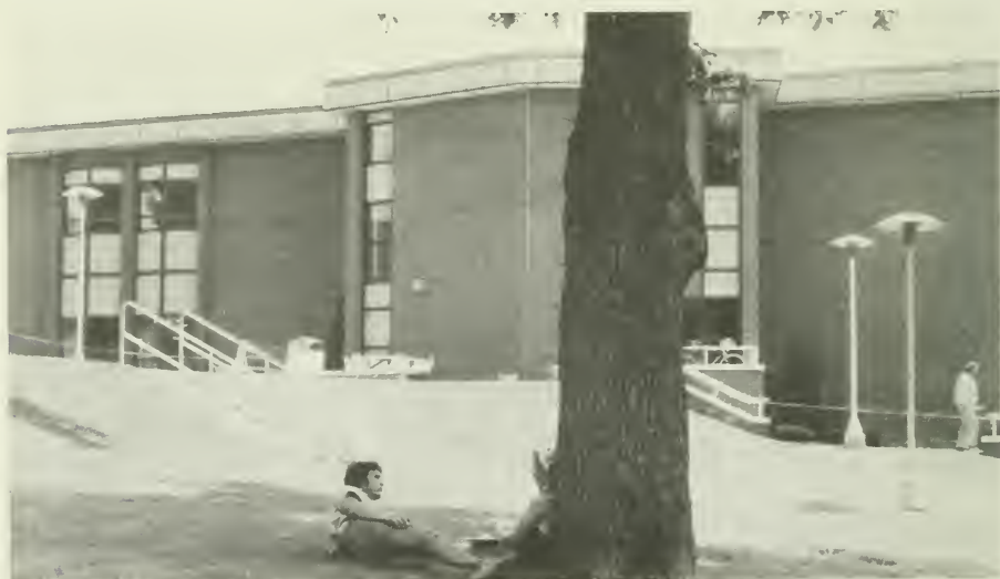
Kehr College Union is the center of student activities.