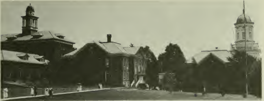
The main campus about 1920.

the years since the granting of the charter, many changes have occurred in the name of the institution and the face of the campus. First there was a new building on a new three-acre campus. The building, Institute Hall, was constructed in 1867 and is known today as Carver Hall.