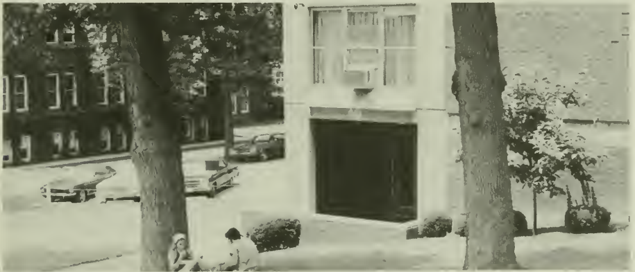
Montour Residence Hall, with Old Science Hall in background.

Like all educational institutions, the normal schools of Pennsylvania