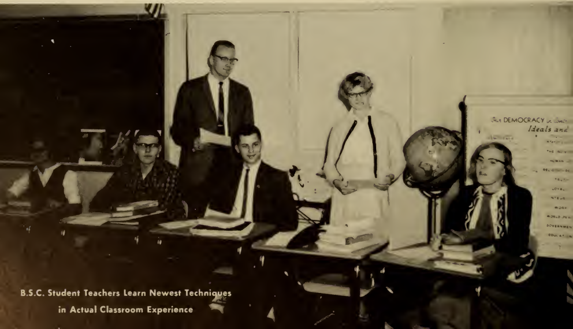
B.S.C. Student Teachers Learn Newest Techniques in Actual Classroom Experience