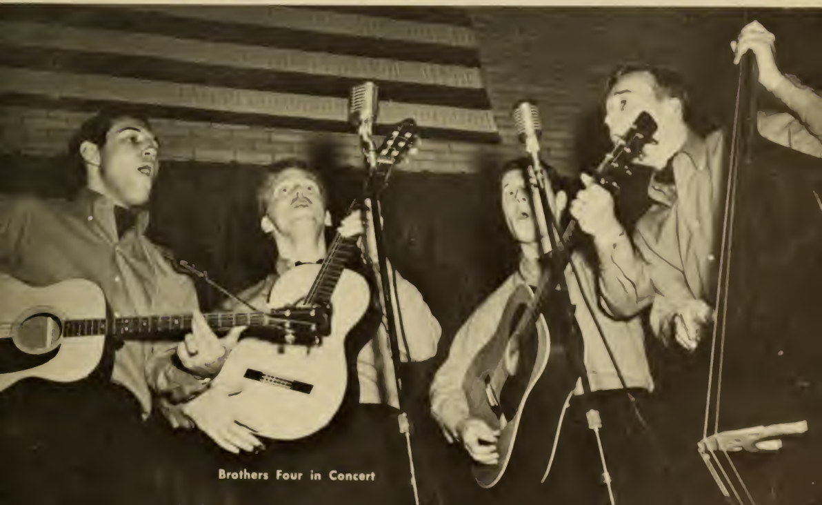
Brothers Four in Concert