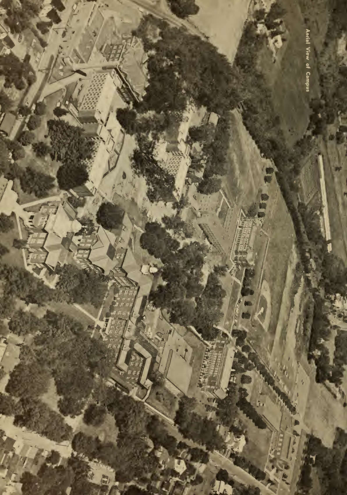
Aerial View of Campus