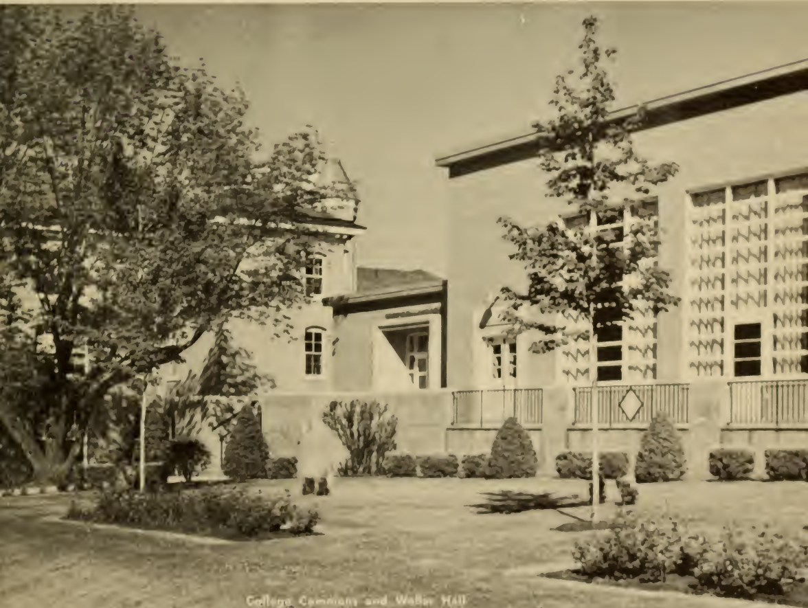
College Commons and Waller Hall

The men's day rooms are on the basement floor of Science Hall. The spacious lounge has facilities for study, recreation, lunch, and storage.