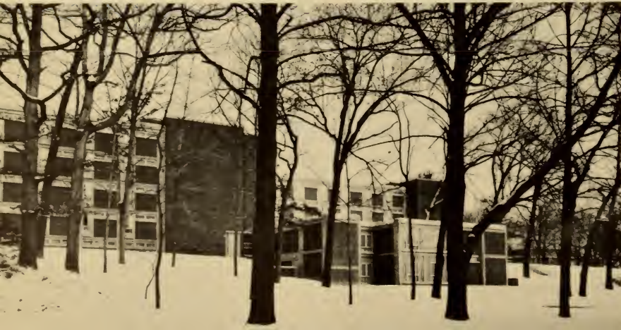
East Hall (New Women's Dormitory)

Econ. 423 — History of Economic Thought 3 cr. hrs. (See Department of Social Studies for course description)