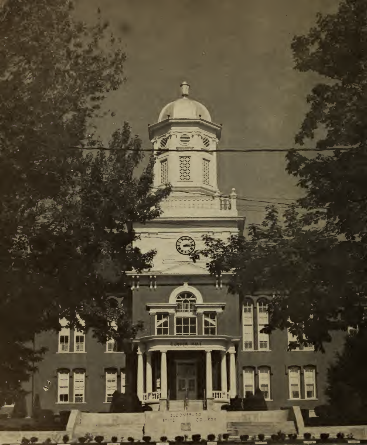
CARVER HALL (Erected 1867)