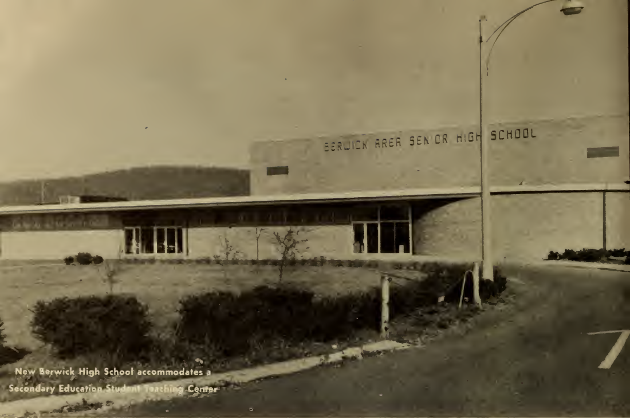
New Berwick High School accommodates a Secondary Education Student Teaching Center