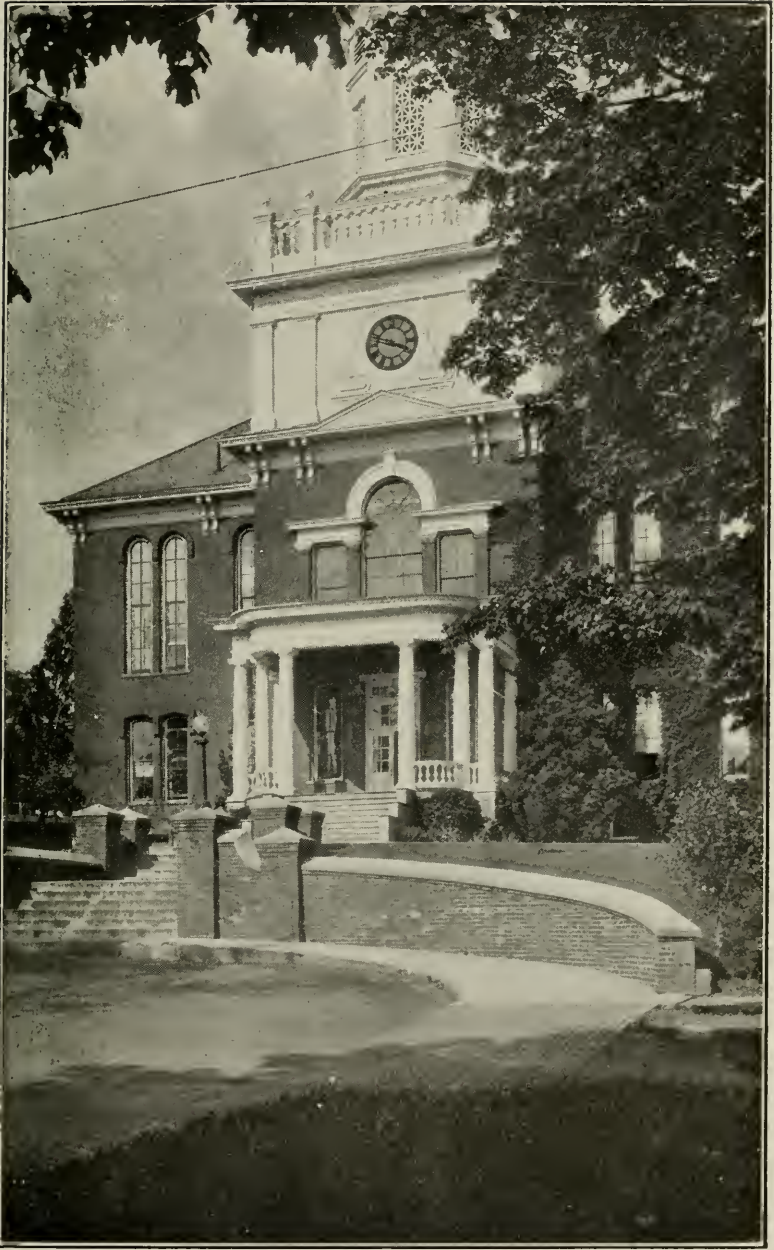
CARVER HALL, ERECTED 1867