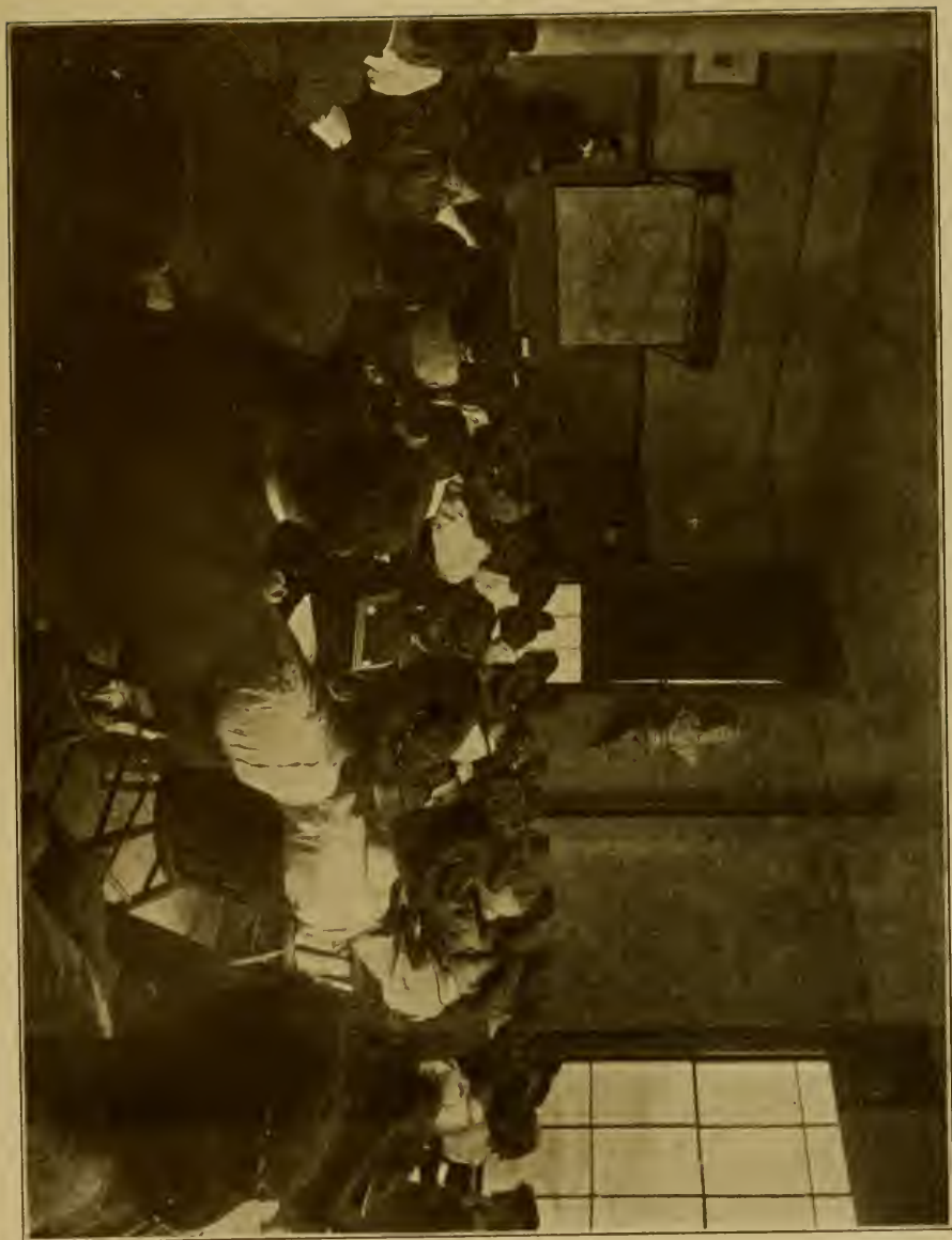
A CLASS IN HISTORY