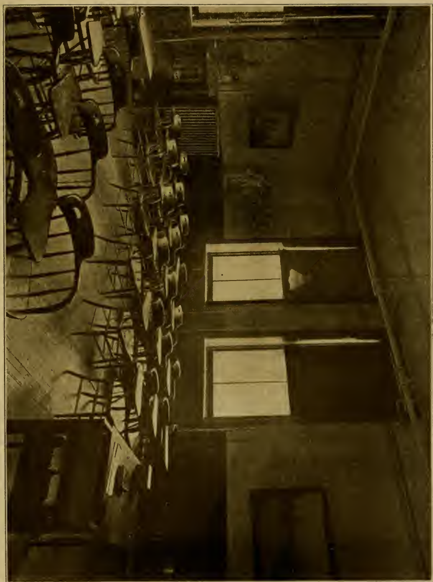
A ROOM IN THE CLASSICAL DEPARTMENT