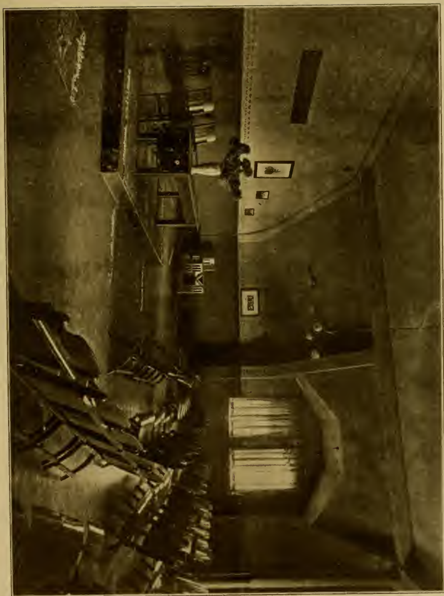
A PARTIAL VIEW OF CALLIEPIE HALL.