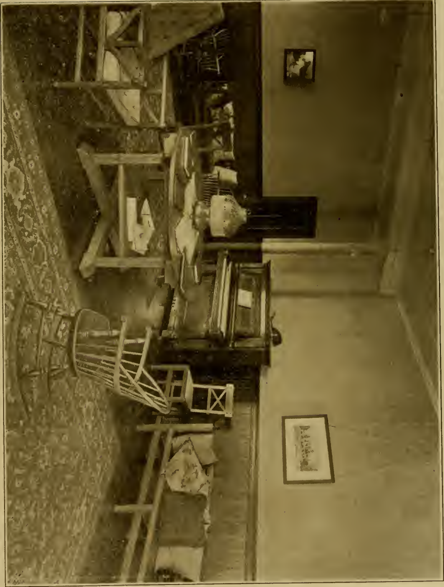
GIRLS' RECREATION ROOM