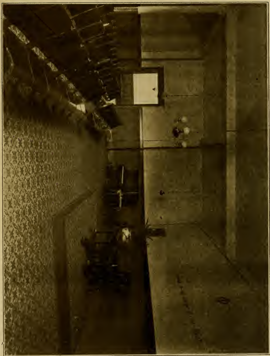
A PARTIAL VIEW OF PHILOGISTIAN HALL.