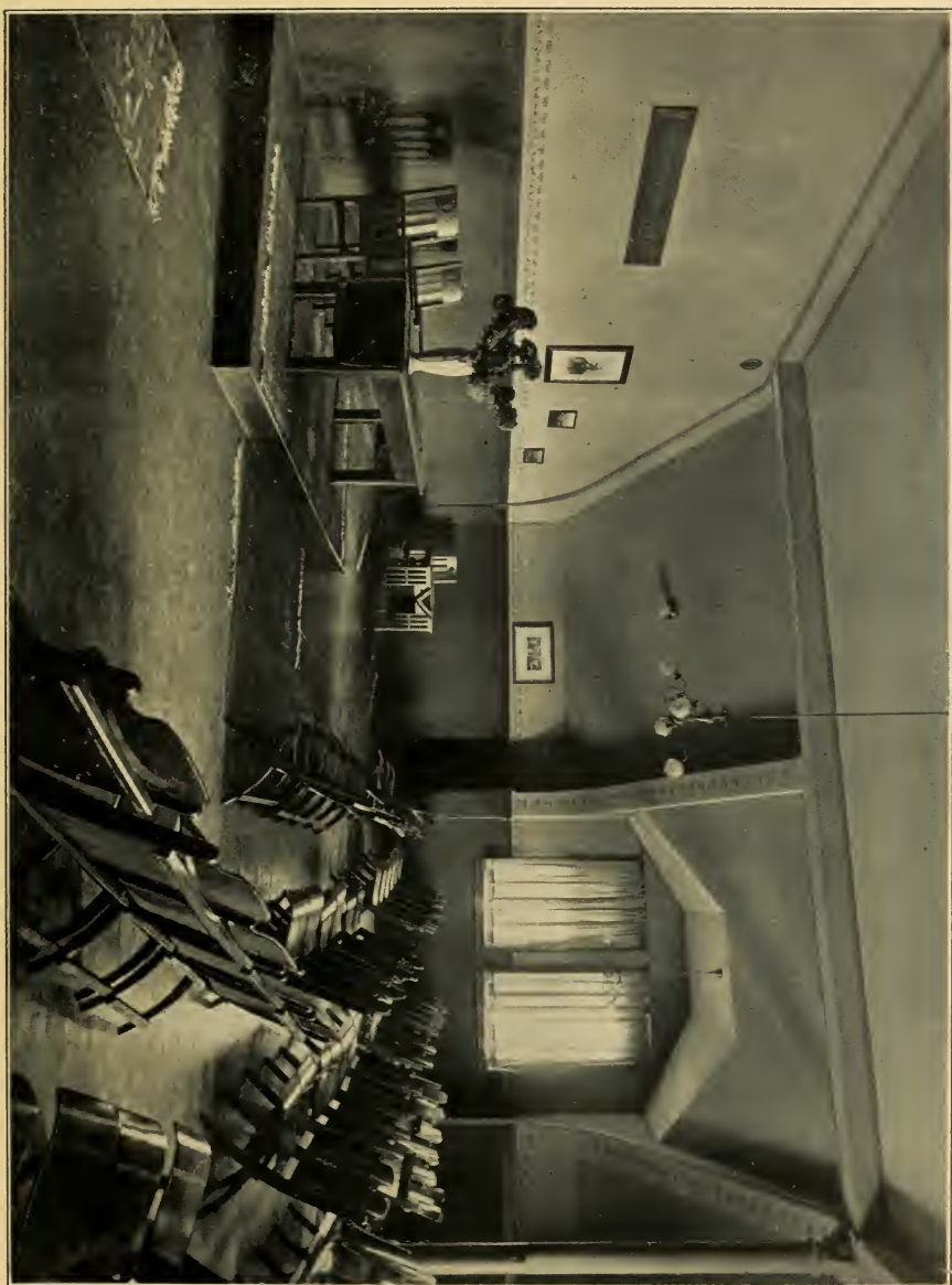
A PARTIAL VIEW OF CALLEPIAN HALL.