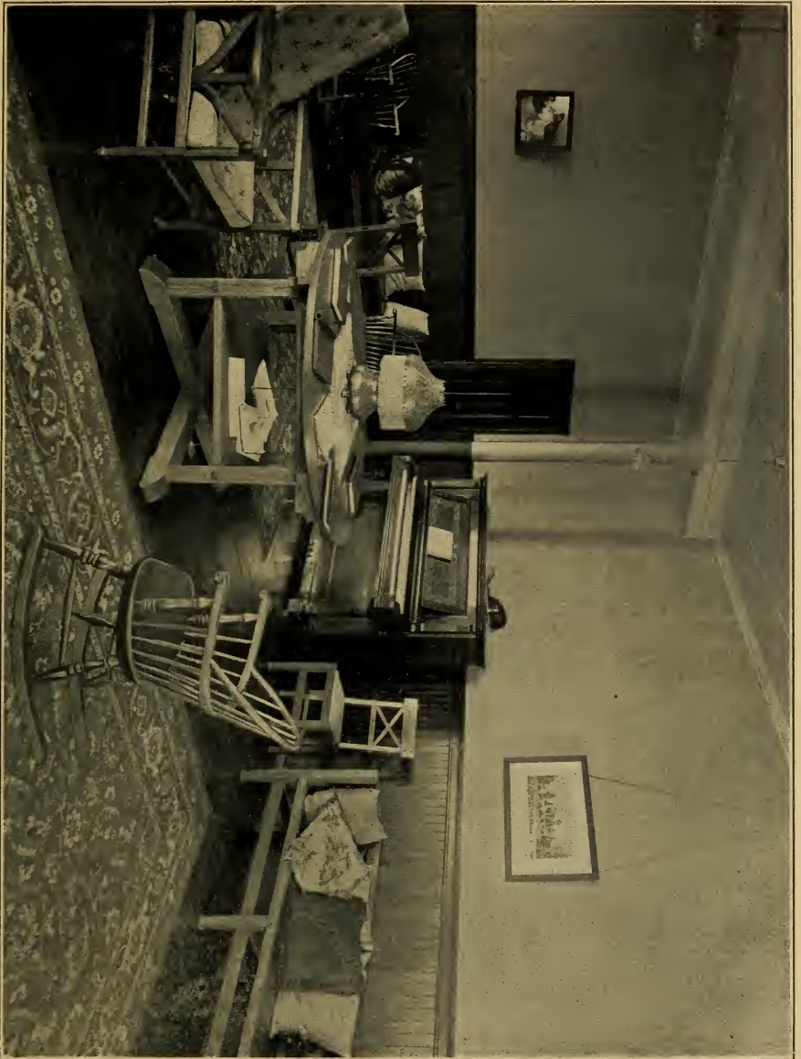
GIRLS' RECREATION ROOM