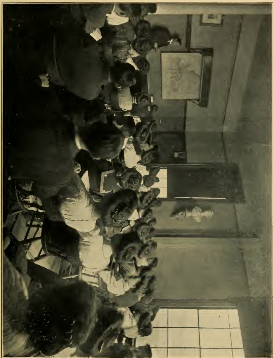
A CLASS IN HISTORY