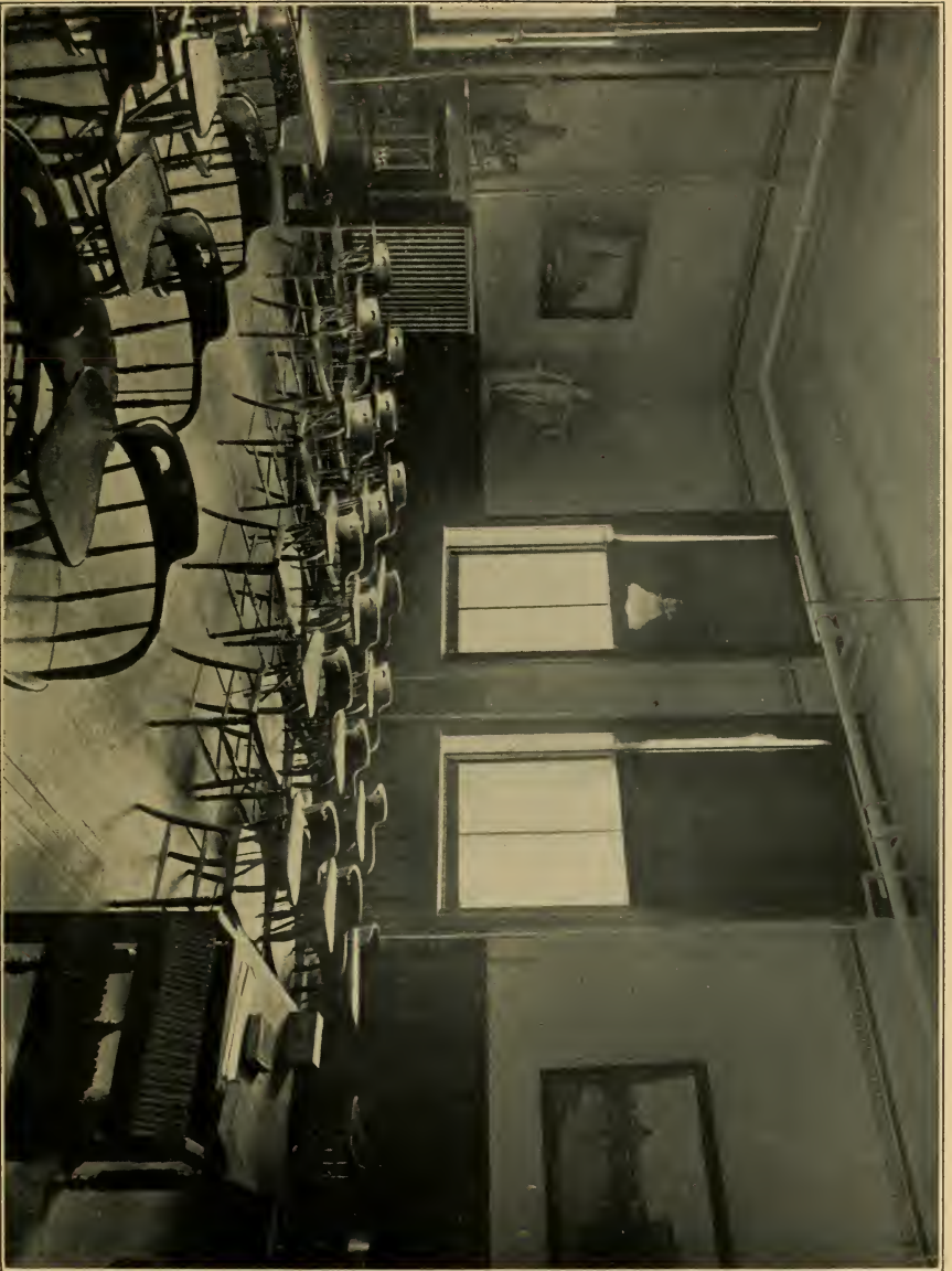
A ROOM IN THE CLASSICAL DEPARTMENT.