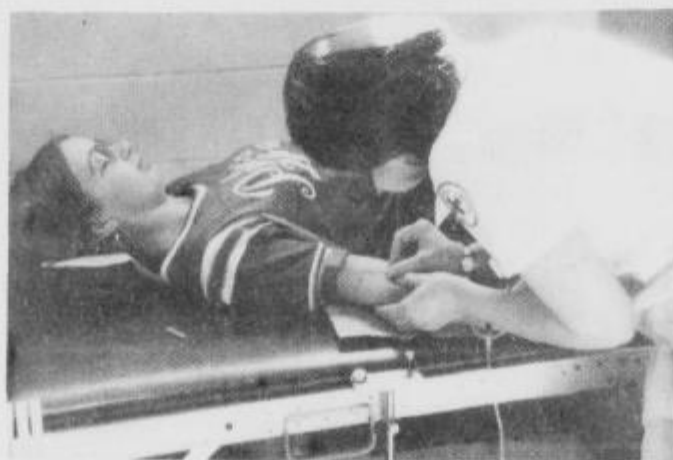
SAVING LIVES - Members of the college rallied yesterday between 11 and 5 p.m. to give blood at the Red Cross Bloodmobile set up in the Woolridge Hall Lounge. Approximately 200 pints of blood were collected during the day.

and $4.50 at the door. You can purchase your tickets in the Secretary's office on the ground floor of the Pub between 1 and 3 p.m. Monday thru Friday.