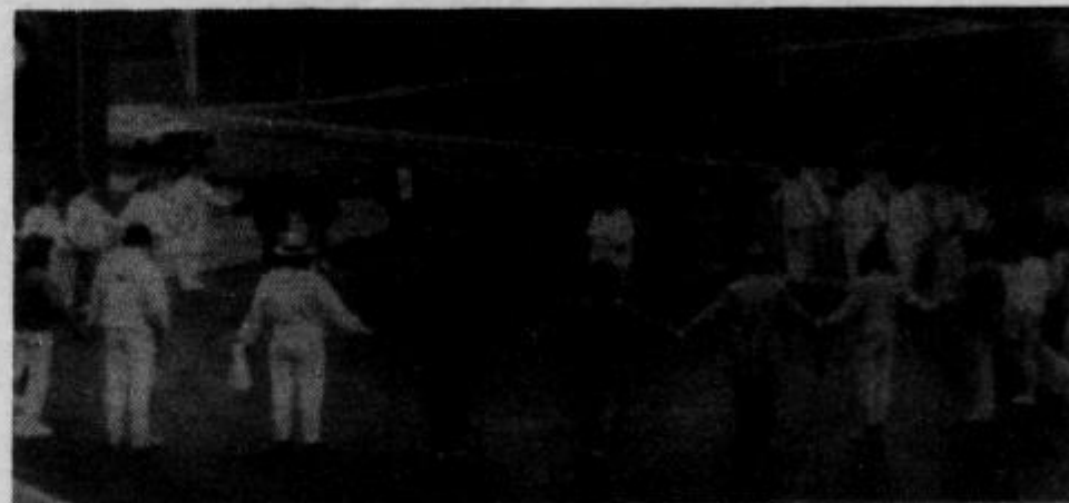
Pro-Choice supporters join together in the field house circle to show their support for the march in Washington on Sunday.