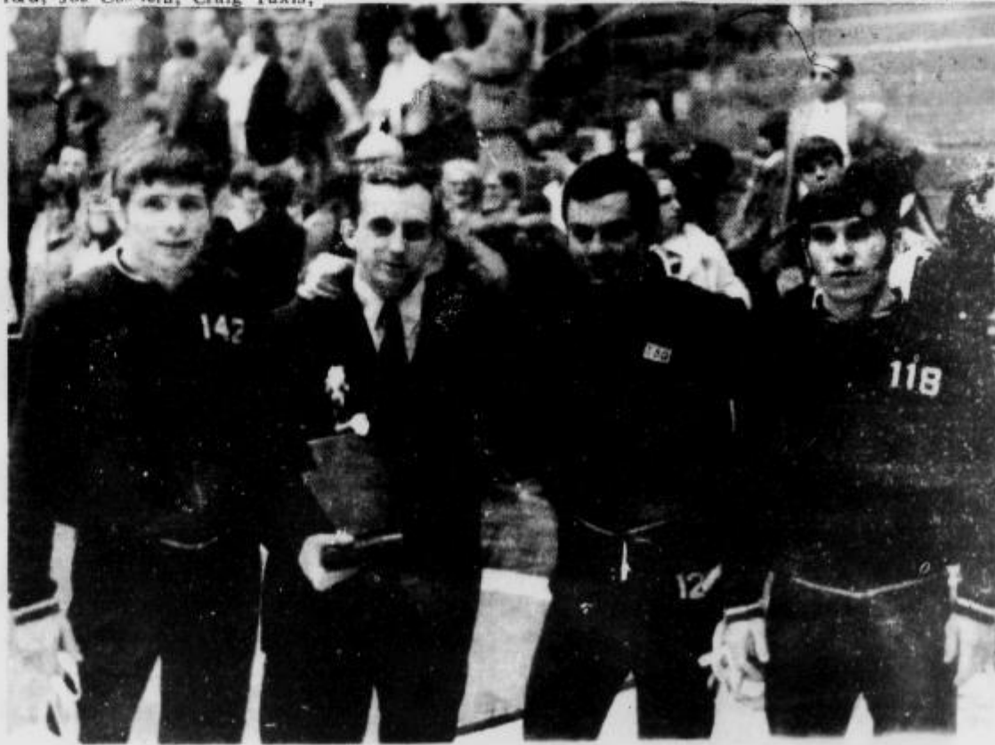
Coach Receives Trophy