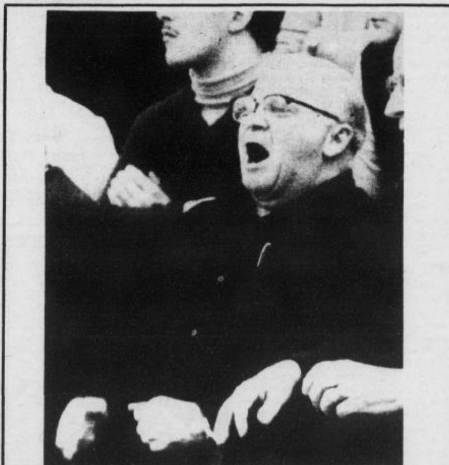
Enthusiastic fan expresses joy as Lock Haven University wrestlers bury Bloomsburg during Tuesday's match. For more on the story, please turn to page 6.