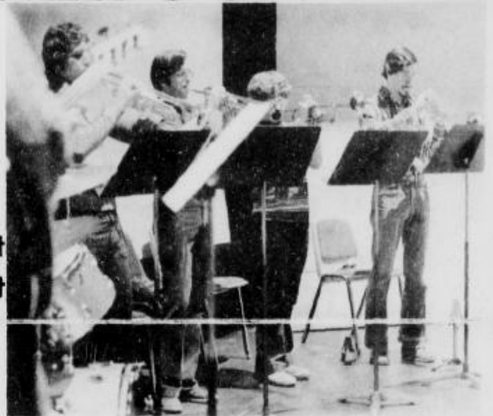
WARMING UP-- Members of the Jazz Ensemble rehearsed last night in preparation for tonight's ensemble concert. The Brass Ensemble and Clarinet Choir will also perform in the musical event open to all members of the college community.

Performing will be the Jazz Ensemble, which has specialized with trumpets and percussion this year, and the newly organized Brass Ensemble. Both are under the cont. on page 4