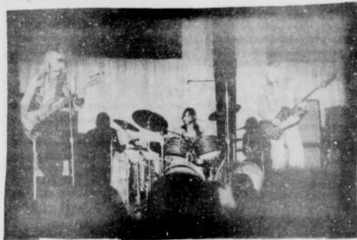
Replacing R.F.O. Speedwagon. Joshua and Company proved to be the surprise of the evening as they performed in concert.