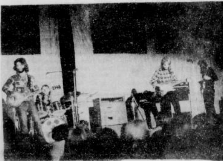
'The House of Noise' really earned its name Wednesday night as a crowd of students from Penn State and LHS grooved to the vibes and volume of Spirit.

Reminder to Students: The doors will open for the Lehigh Wrestling Match at 5 p.m. on Sat. Dec. 2. Students are asked not to sit in the reserved sections, the North and South bleachers. Students may sit anywhere in the East and West bleachers and on the floor surrounding the mat.