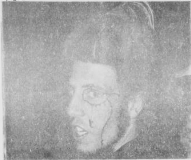
HALLOWEEN ON HENDERSON ST. - This is just one of the many "get-ups" you'd be likely to see at LHSC this weekend.