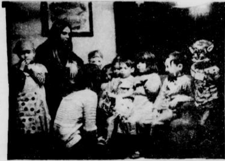
The Headstart and Follow-Up children enjoyed games and refreshments at a Halloween party Wednesday night. The brothers of Phi Mu Delta and the sisters of Zeta Tau Alpha co-sponsored the party which took place at the Phi Mu Delta house.