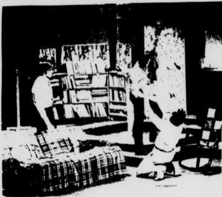
College Players perform "The Sign in Sidney Brustein's Window." The play can be seen tonight and tomorrow night at 8 p.m. in Price Auditorium.

WE ARE THE PEOPLE OUR PARENTS WARNED US ABOUT.