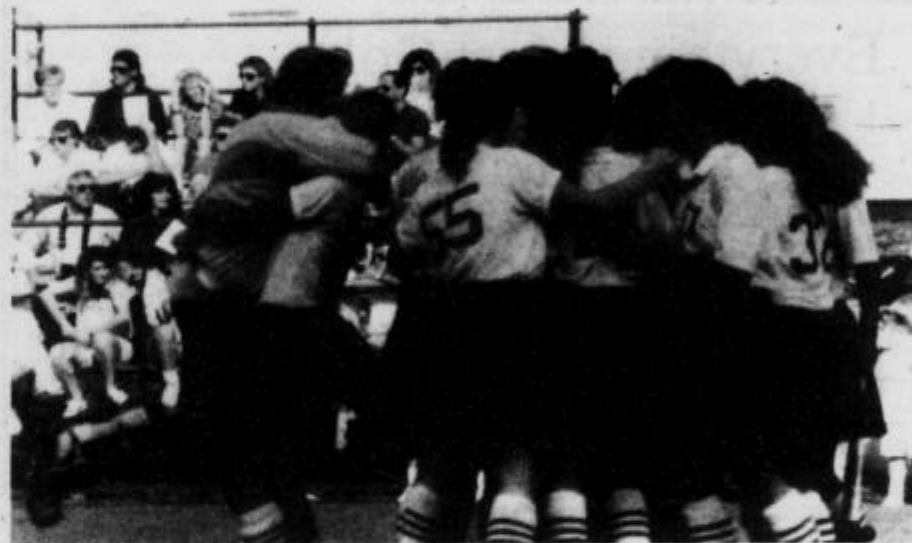
Lady Eagles celebrate after winning the PSAC Championships this weekend.