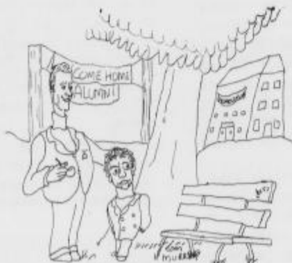
"And After I Swallowed the 97 Gold Fish, Junior, I sat on that bench right there and spit them out for 93 days."

Whatever makes an individual homecoming celebration special — the sports, the concerts, the new friends and old, "homecoming" as such will still be real to the older alums to whom Rogers may be the only recognizable place on campus. Admire the Sloan building's architecture, retaste the meals in Bentley Hall, once again feel the hard Stadium Seat against your bottom. Stroll over to the "Antiques and Collectables" show in Rogers gym. And when no one's looking, give him a pat or a smile as you go by. He'll always be here to come home to.