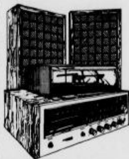
8-TRACK, AM/FM STEREO SYSTEM WITH BSR CHANGER