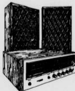
8-TRACK, AM/FM STEREO SYSTEM