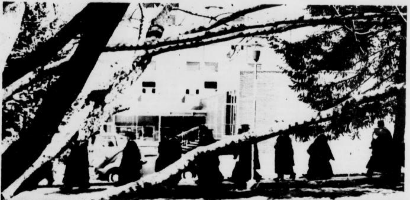
FACULTY PROCESSION PASSES IN FRONT OF ULMER EN ROUTE TO CONVOCATION