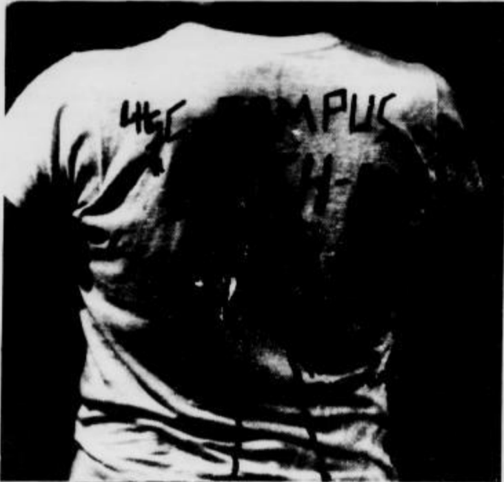
FALL FASHIONS? "Bitch In" T-shirts were on display this afternoon when more than 700 students gathered to criticize situations, plead causes, and bitch.