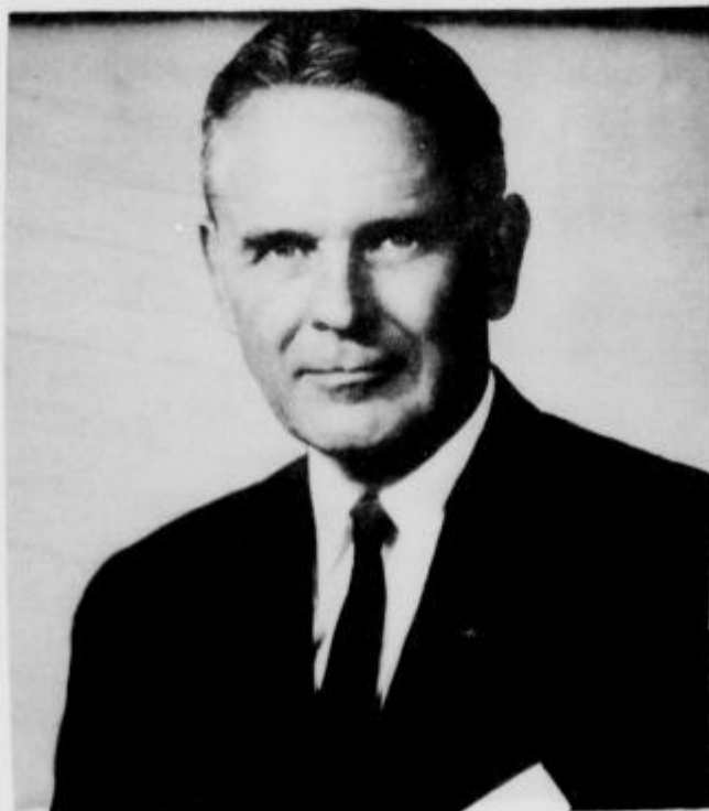
General Maxwell Taylor