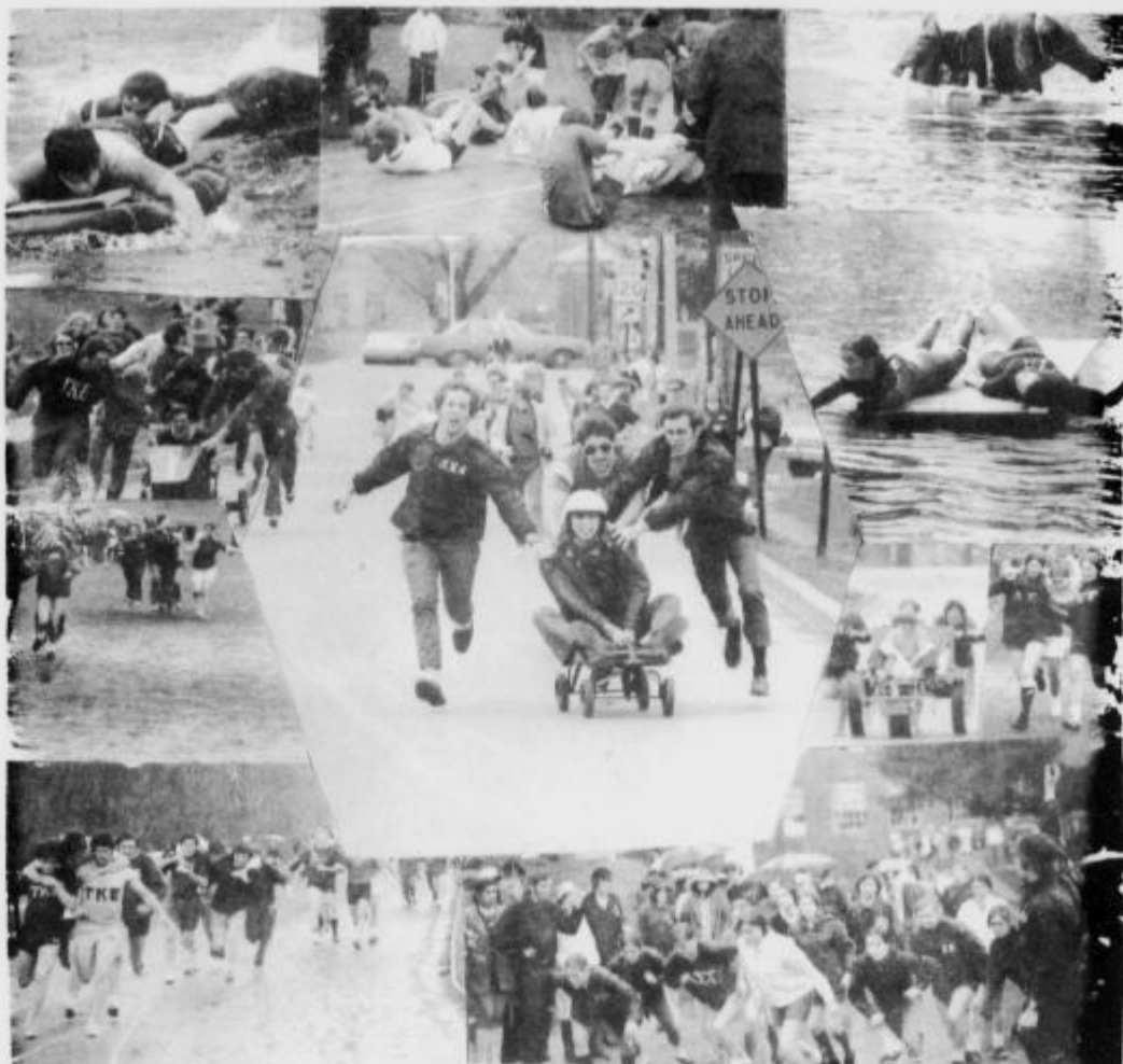
Fun prevails at Greek Weekend - How about it Lambda Chi?