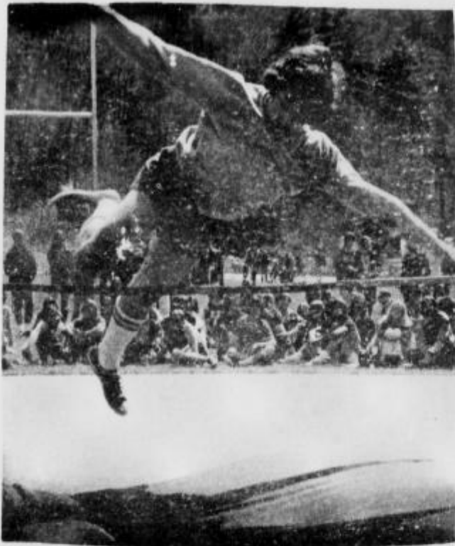
KDR FINISHES FIRST-- In the annual Greek Olympics held yesterday afternoon Kappa Delta Rho ran away with the contest with 42½ points. Tau Kappa Epsilon finished second with 31 points followed by Phi Mu Delta scoring 18. Alpha Sigma Tau won the sorority competition.