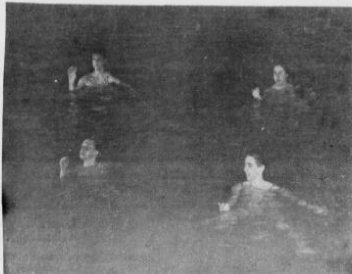
SYNCHRONIZED SWIMMING--The Lock Haven State Aquafins are shown above as they performed this past weekend in "A Musical Nostalgia." The show will be repeated next Sunday as part of the Parent's Weekend activities.