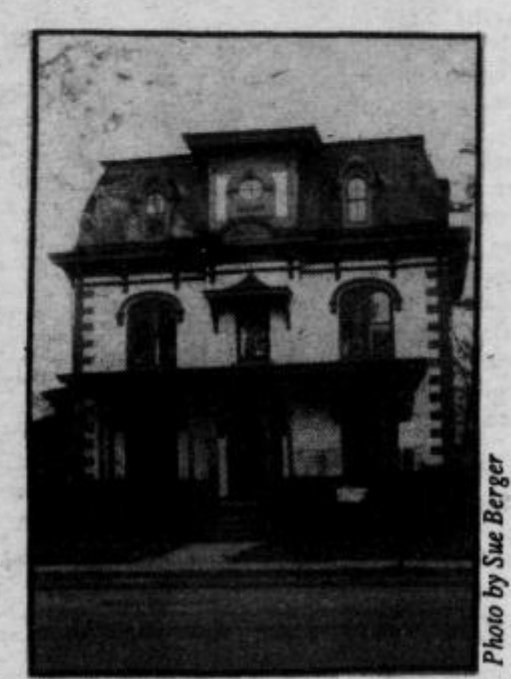
220 W. Main St.

"One of our main goals was to get a house, but now that we have one AXP does not plan to lose its ties to community service," said Bell.