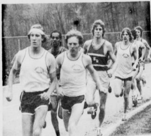
LH OUT IN FRONT--Yesterday Lock Haven met Clarion and Slippery Rock in track. Results were not available at press time.

The Eagles will host Slippery Rock at 1:00 on Wednesday.