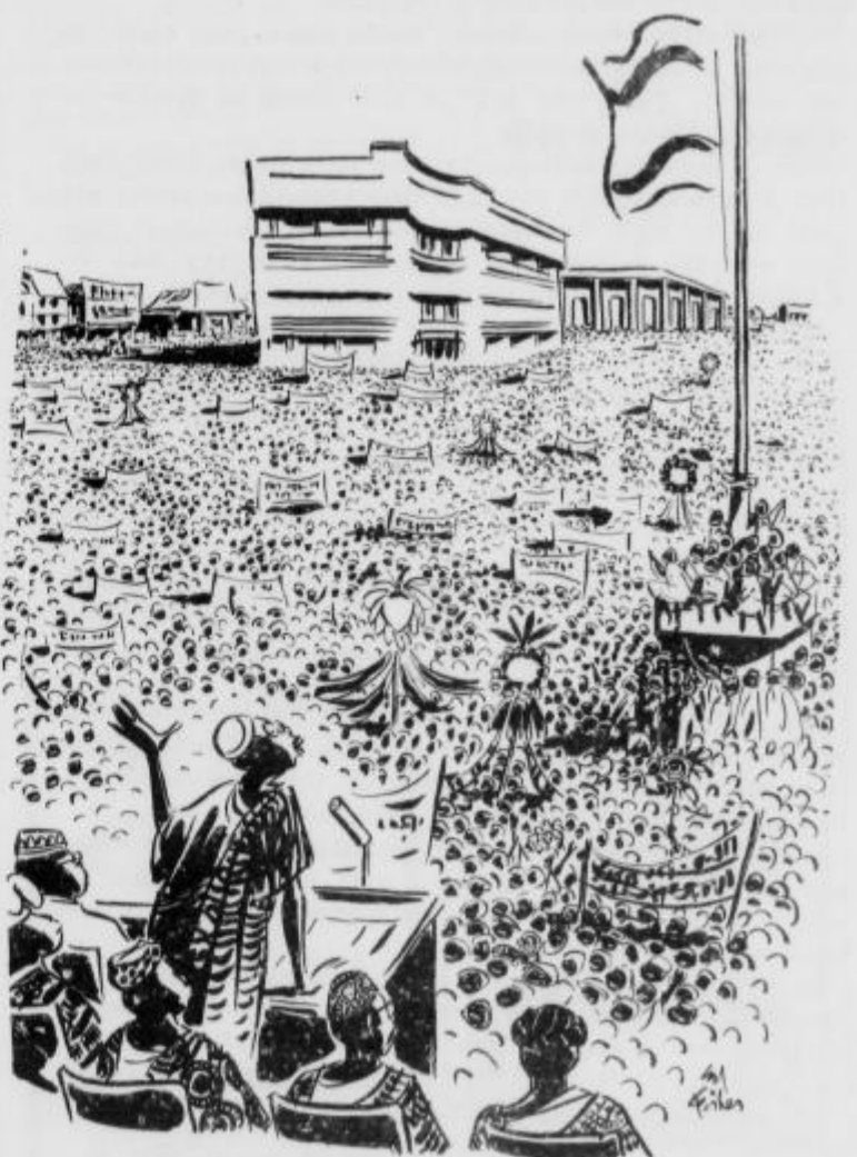
"I have been asked to announce that the fertility rites will be omitted from this year's festival."