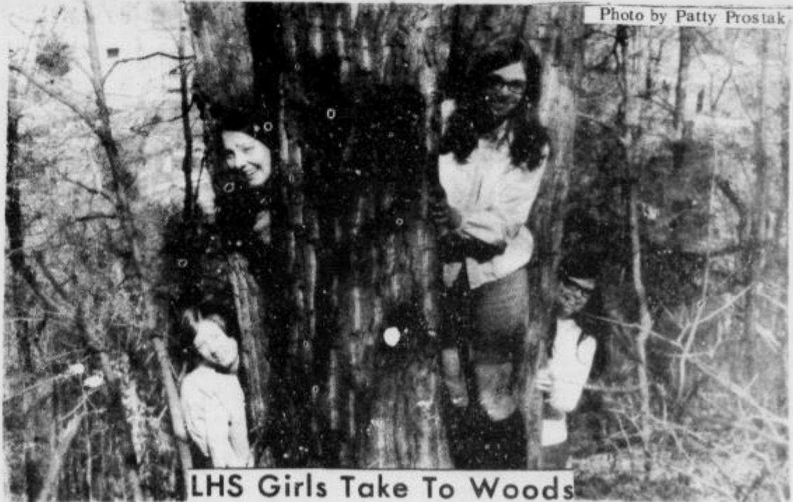
LHS Girls Take To Woods