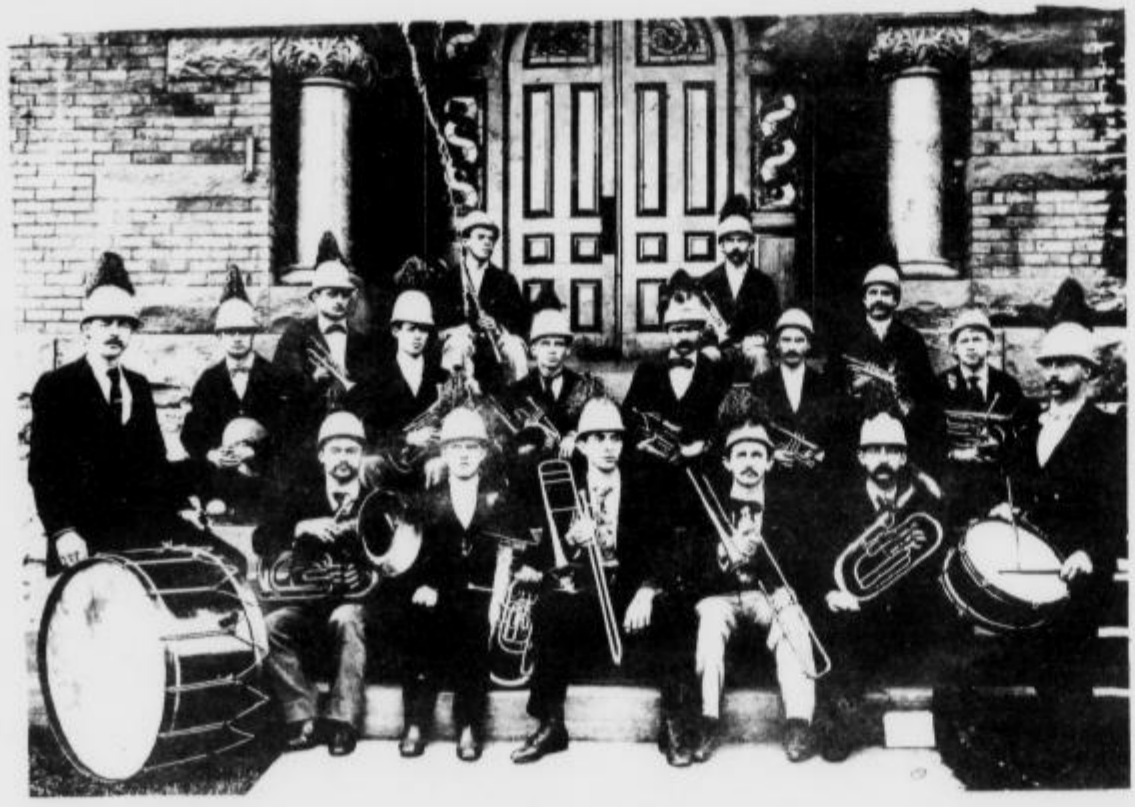
Congratulations are extended to the LHS Music Department for their fine selection of new band uniforms. The plumes on the hats are especially colorful.