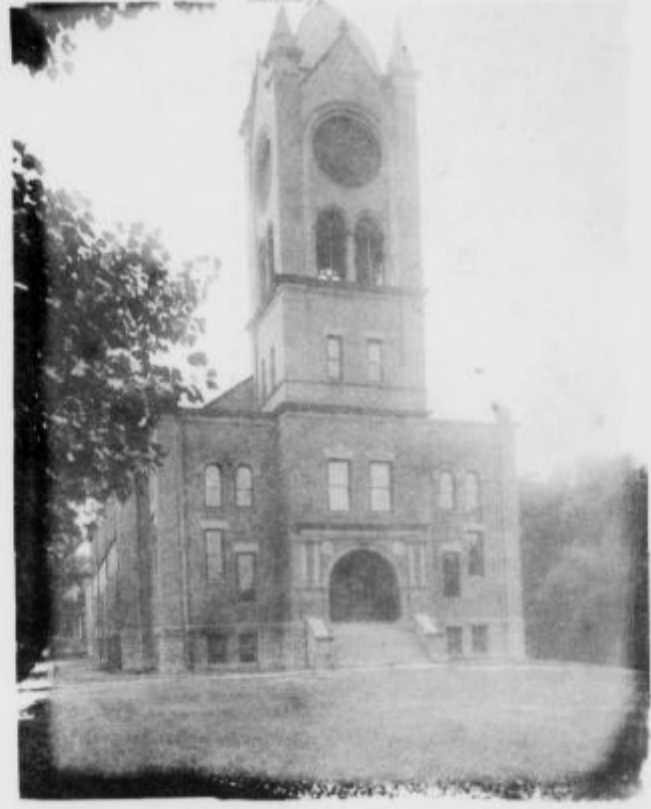
The Fine Arts Building at Lock Haven State College seen from a photographer's view. What a beautiful addition to the campus!

The original was developed under the direction of Kenneth S. Fagg, noted cartographic illustrator. Authenticity was assured by a consulting staff of experts from the American Geographical Society, Columbia and Clark universities, and the United Nations on permanent display on the ground floor of Stevenson Library, Lock Haven State College. Reproductions are fabricated of epoxy reinforced with Fiberglass laminations, the most stable and durable casting medium currently available.