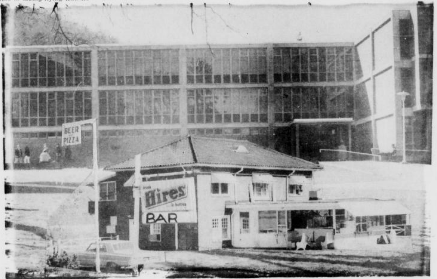
The newest recreational facility to hit the Lock Haven State College campus.

The concert is FREE except for a small fee of 11¢ to compensate for travel expenses.