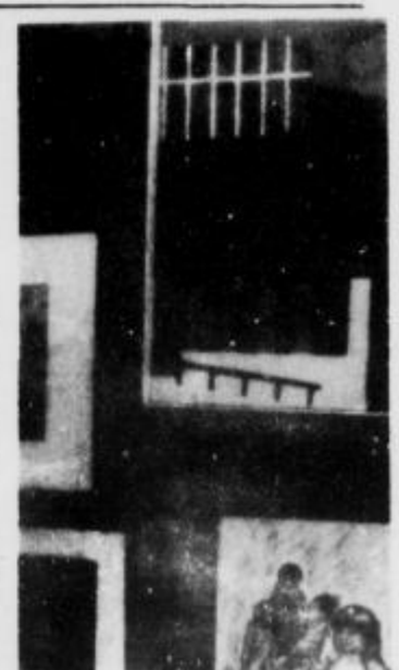
on display in Raub Hall

Both student and public response to the show have been good. Their was a favorable turn-out at the formal opening, and a steady stream of viewers flow past the exhibit each day. The exhibit has been commented upon as being 'the best student show ever." This writer encourages all students to expose themselves to this artistic experience. exhibit will be up for two more weeks when it will be replaced by the faculty show in the first week of March