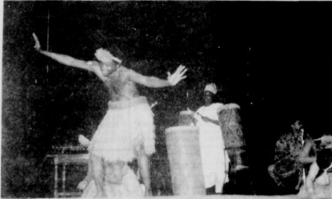
Olatunji provides the beat and a member of the cast provides the bounce in last night's performance before a full house in Price Auditorium.

Vol. XV No. 42 Lock Haven State College Friday, Feb. 2, 1973