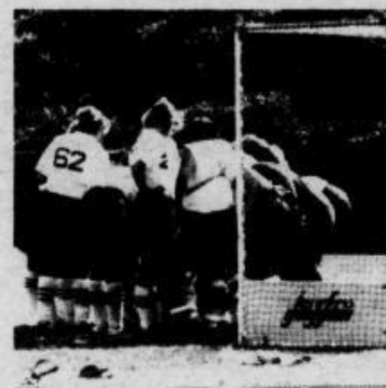
Field Hockey team bound for NCAA Division III in 1990.

The Lady Eagles finished their 1988 season with a 7-12-1 record.