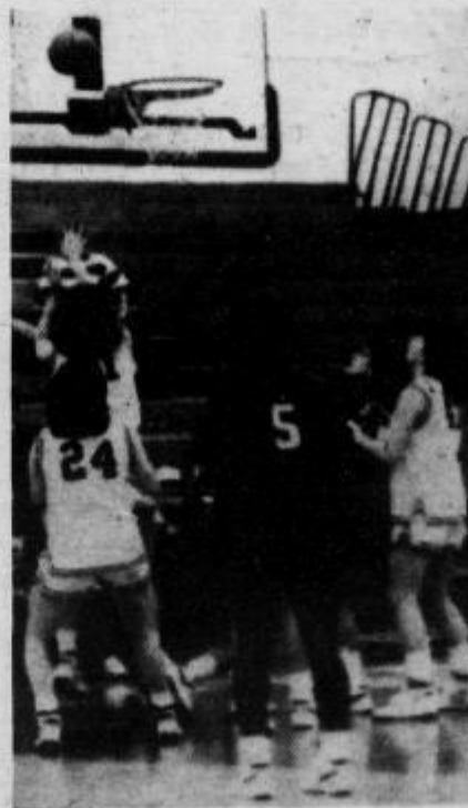
Lady Eagles clinch playoffs.

"We are one game away from being champions," he added. "The team needs to be psyched for this game without hearing from their coach."