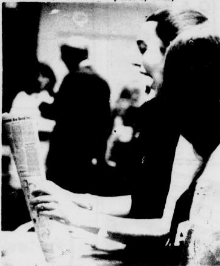
"Those editors never prin" THAT word before!"

represent the US in competition against the 1969 Canadian titleholders for the North American College Music Championships.