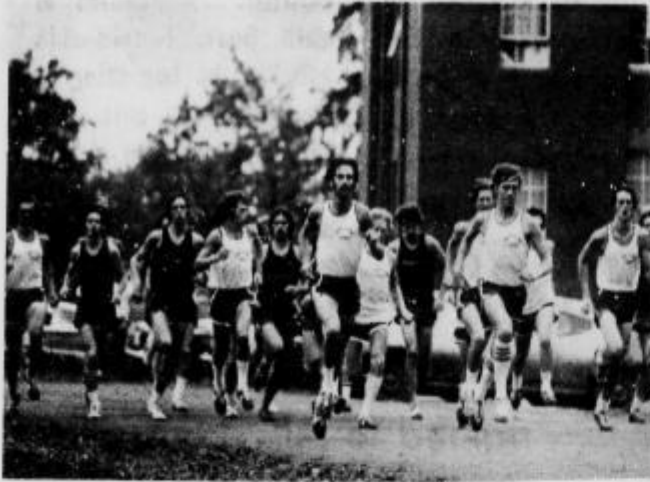
Gaige Continues as 'Leader of the Pack'