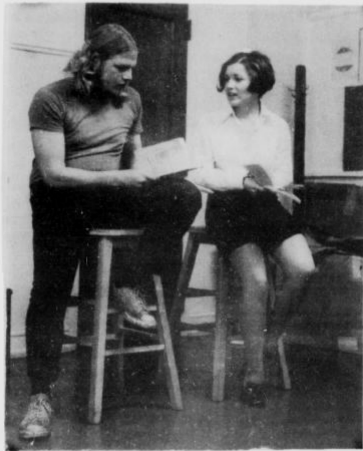
Reader's Theatre members rehearse for next production.

Friday Fraternity Housparties Dance in Rogers Gym featuring 9 p.m. to 3 a.m.-free $1.00 Saturday Parade with floats-assembly at 10 a.m. in front of FFH. Football game with Edinboro-2 p.m. Dedication of the PUB Cider Post sponsored by the Varsity Club-practice field below Smith Hall Ox Roast-practice field-free $500 Fireworks-Riverside Parking Lot 8 p.m. Movie Orgy-Price Aud.-9 p.m. to 3 a.m.-no charge Sunday Canoë Race-Riverside Parking Lot-2 p.m. Blanket concert featuring "The Grass Roots" and "Dawn" Bentley Hall-8 p.m.-free/$3.00