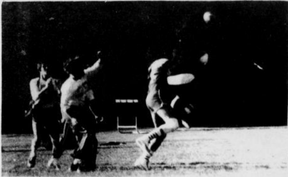
INTRAMURAL SPORTS provide entertainment for many Lock Haven State students. About ten teams participate in the intramural football program.