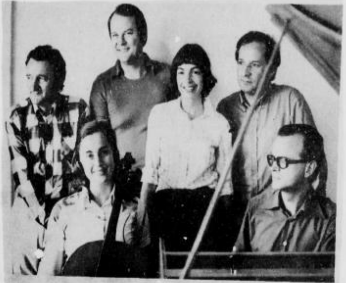
LAST NIGHT -- in Sloan Theatre the Freiburg Baroque Soloists performed. The Soloists ensemble included instruments such as the viola and harpsichord.